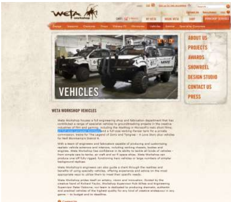
Website der Special-Effects-Company von Peter Jackson